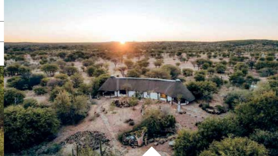
OHORONGO PRIVATE RESERVE