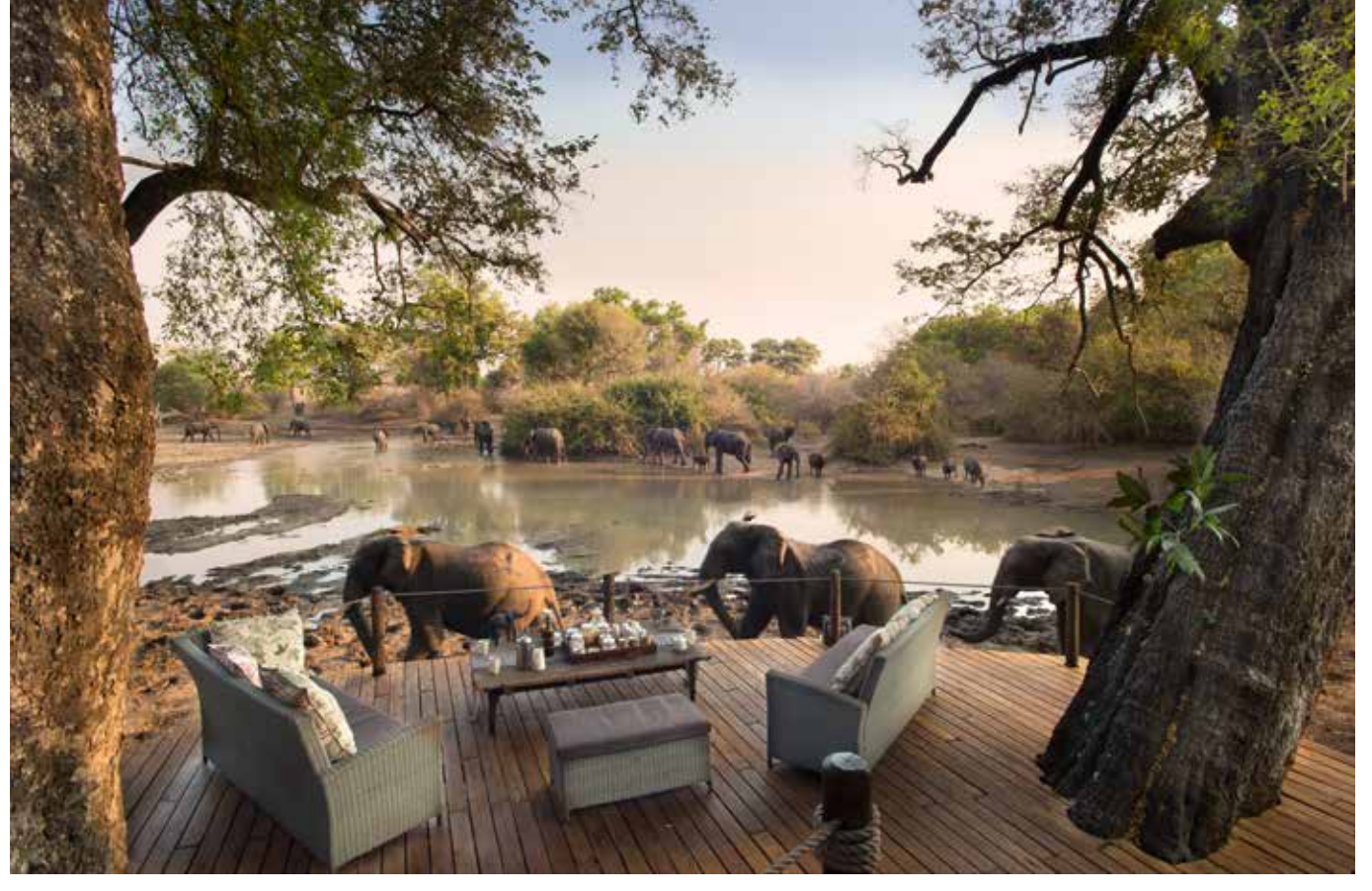
ABOVE Unlike most camps in Mana Pools, Kanga is situated well inland of the river. Here guests can experience a different aspect of the park as riverine forest gives way to woodland, savanna grassland and wide pans.

aboons leapt through the stream where a zebra carcass lay. Two lionesses and their cubs relaxed in the cool sand nearby, bellies bloated. Behind us the distinctive chirruping of wild dogs could be heard as they made a beeline for the carcass. Upon arrival they spotted the lions, including a large male who'd just appeared. Having second thoughts, the dogs turned tail and trotted off. Minutes later we heard them yelping, and elephants trumpeting in agitation. The male lion bolted in the direction of the noise with us hot on his heels.