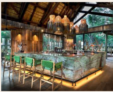
Updated: May 29, 2024